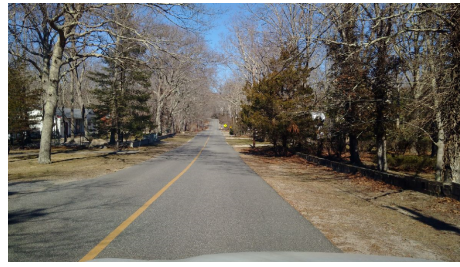
From left to right: Streetscape within Sag Harbor Hills, Streetscape within Azurest